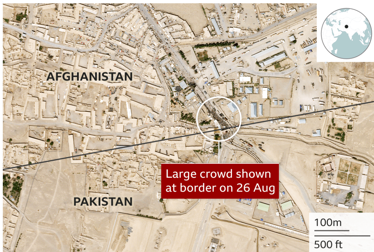
Figure 2: Border crossing refugees. Available at: https://www.bbc.com/news/world-asia-58283177 (accessed 14.9.2021)